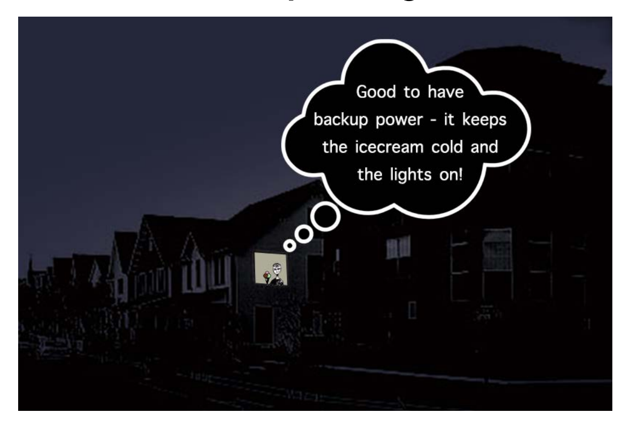
RAAC Steering Committee Meeting March 9, 2015